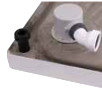
Graduated adjustable leg system