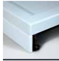
Adjustable legs & tray panel kit